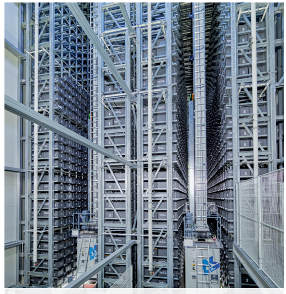
Automated small-parts warehouse for 8,120 bins