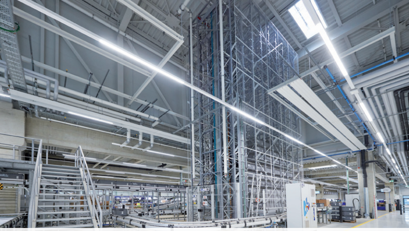
12 meter high automated order consolidation buffer