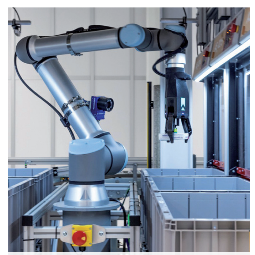
Fully automated robots pick from 6 bins into the target carton