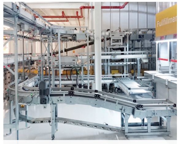
Conveyor technology to the robot picking cell