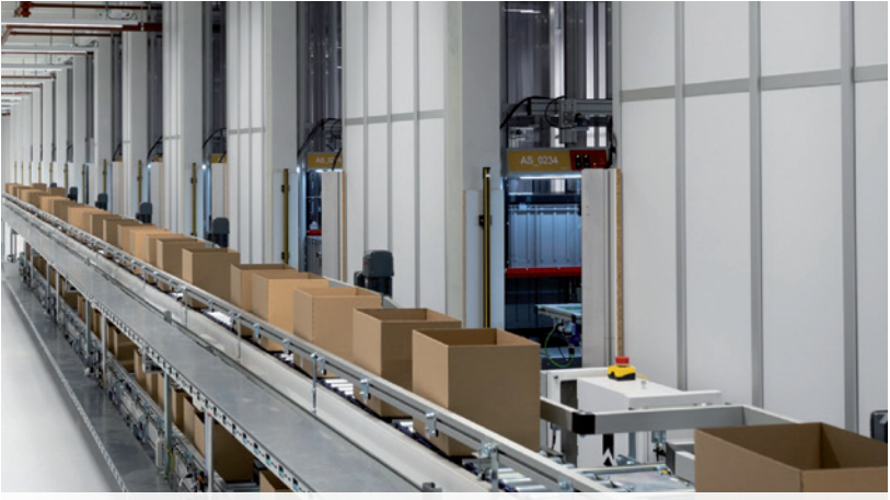
Piece picking with conveyor connection