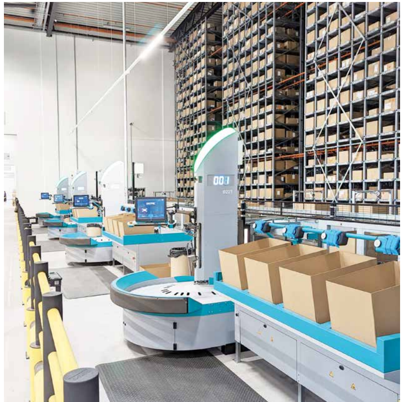
Picking stations with racking system

An Exotec system designed for around 51,000 trays was installed as an automatic carton warehouse. To ensure high system performance, 79 Skypod robots are used, which are responsible for storage and transport of the trays to the order picker. The Exotec system can be flexibly adapted to changing products, variants, order situations and order structures and is used for storage, order picking and at the same time as an order consolidation buffer. It connects carton, container and pallet conveyor technology with goods receipt and shipping. A high degree of automation in carton handling with automatic erector, volume reducer and sealer as well as labelling and palletizer reduces throughput time. Goods receipt is also automated and equipped with a robotic system for depalletizing and automated carton opening. KlinkWARE is used as the material flow control. As an all-included service package, Klinkhammer takes on full service for the entire system with its own on-site staff. The service also covers maintenance and spare parts handling.