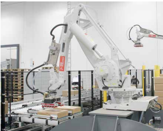
Automatic palletizing / depalletizing