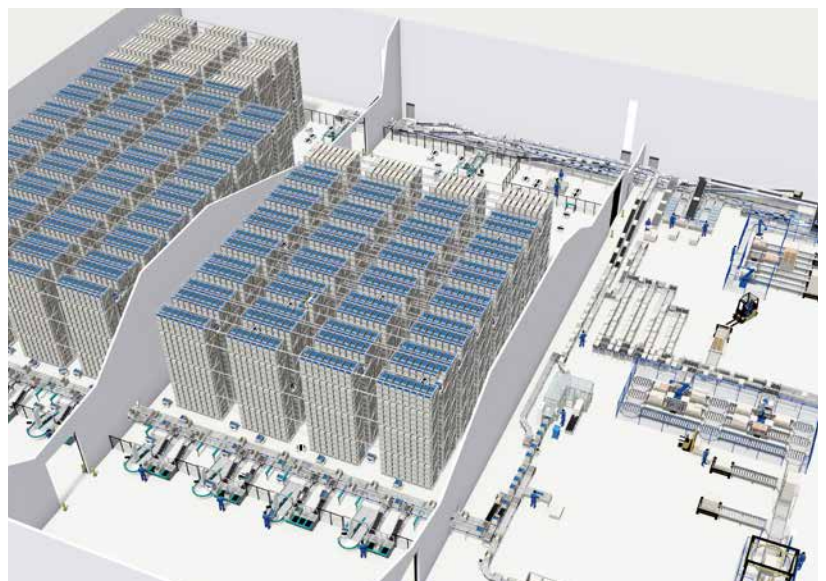
Exotec system with 51,000 trays and 79 Skypods