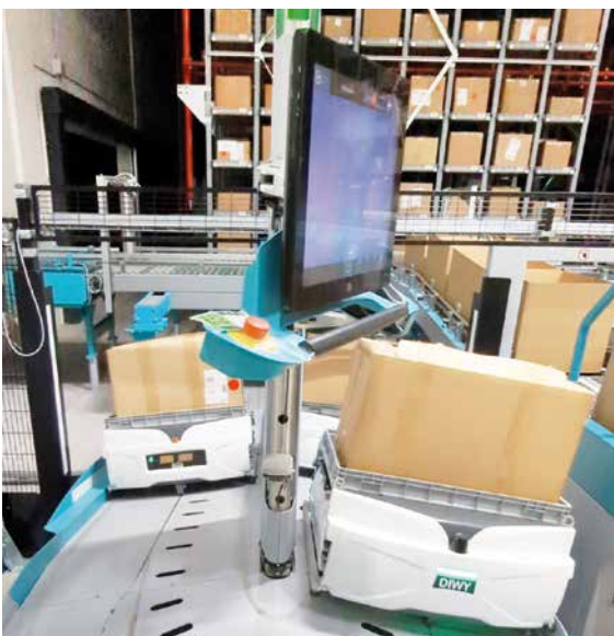
Picking station with Skypod robots