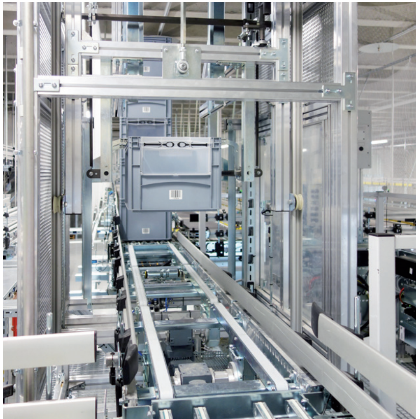
Empty container buffer with stack technology