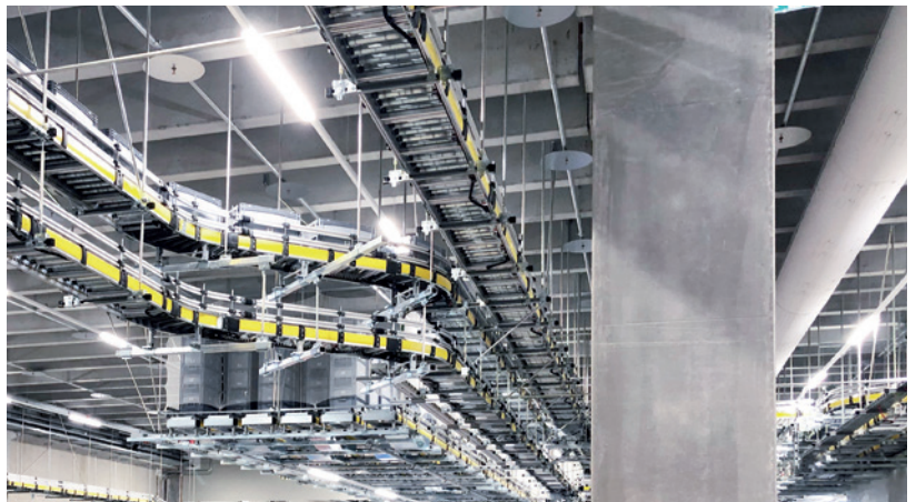
Suspended conveyor technology