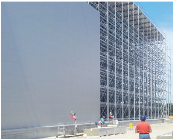
4-aisle automatic high-bay warehouse