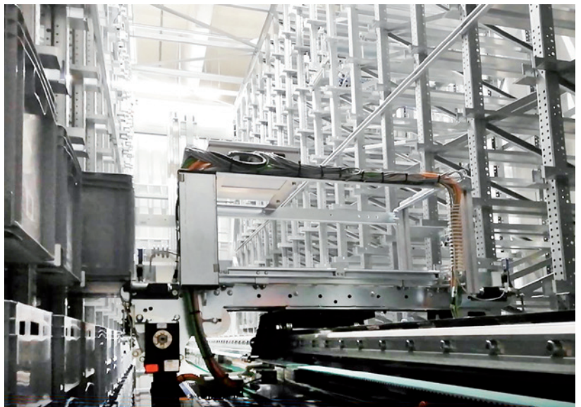
Automatic order consolidation buffer