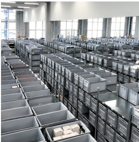
Drawer system for 4,340 drawers