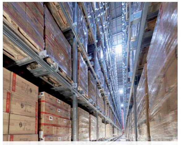
2-aisle, fivefold-deep channel storage