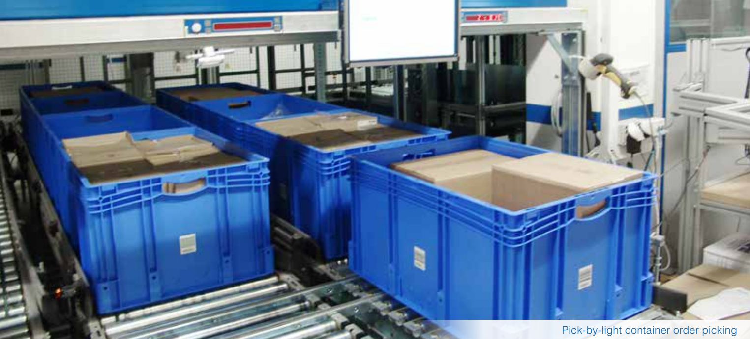
Pick-by-light container order picking