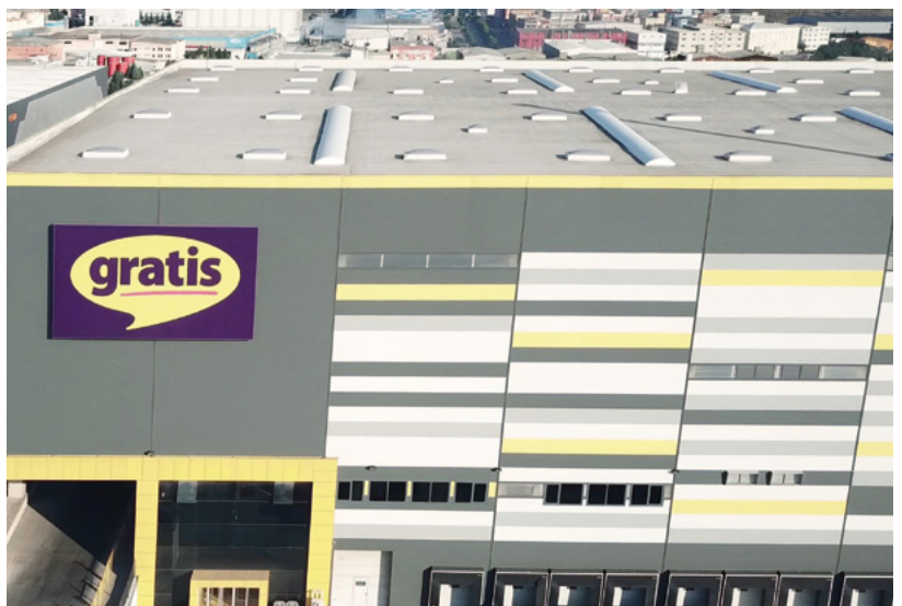
Distribution center of the drugstore chain with 600 stores