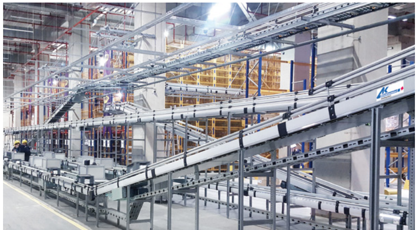
E-commerce tower with conveyor connection