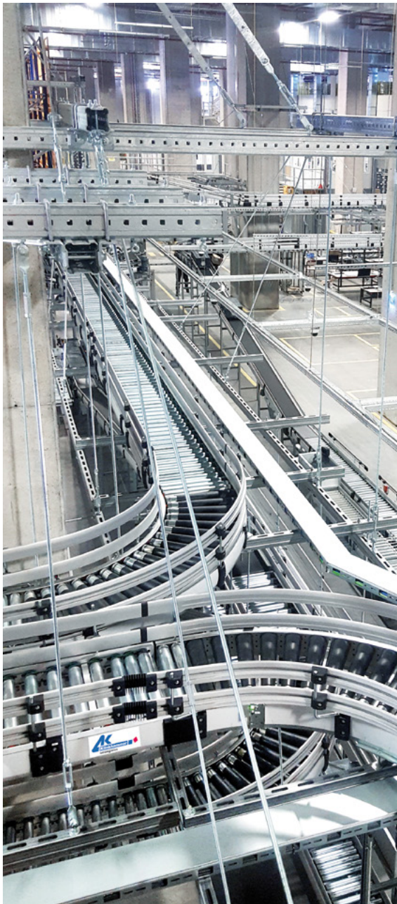
2 km of high-performance conveyor technology controls the material flow from the start of the order to dispatch