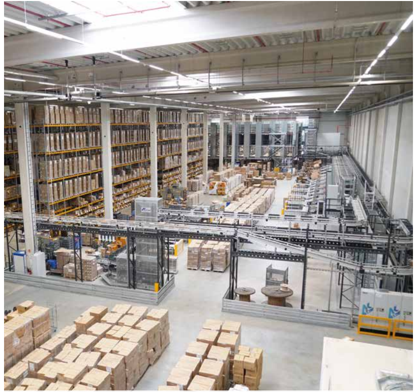
Pallet warehouse with 25,000 storage locations, shelving system for 60,000 containers with conveyor technology

A three-storey shelving system ensures flexible storage of containers and cartons. It holds 60,000 containers in the size 600 x 400 mm with different height classes. Conveyors connect 18 picking stations to 14 goods receipt stations, to the automated order consolidation buffer with 1,084 container storage locations, to 20 packing stations and to dispatch. The package conveyor line leads from the ergonomically arranged packing stations to the dispatch gate and automates loading up to the truck. In addition, a forklift-operated pallet warehouse for approx. 25,000 storage locations enables fast handling of palletizable goods. The warehouse management software and material flow control KlinkWARE® guarantees short lead times and lean processes due to the storage, retrieval, transport and order strategies precisely tailored to dataform.