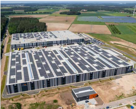
dataform logistics center