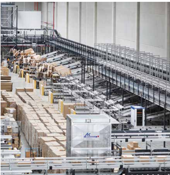
20 automatically connected packing stations