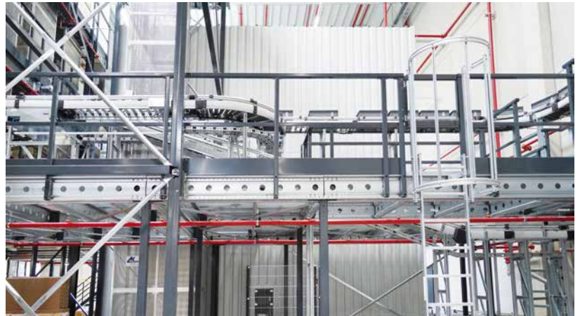
Order consolidation buffer with 1,084 container storage locations