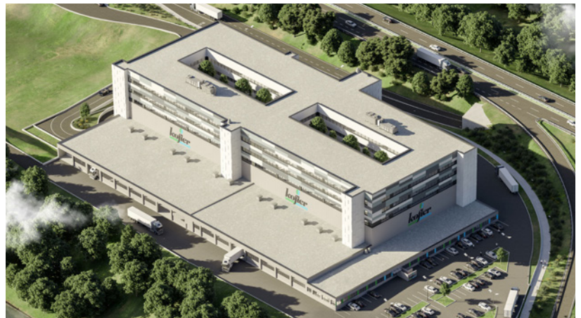
Kofler Center in Tirol