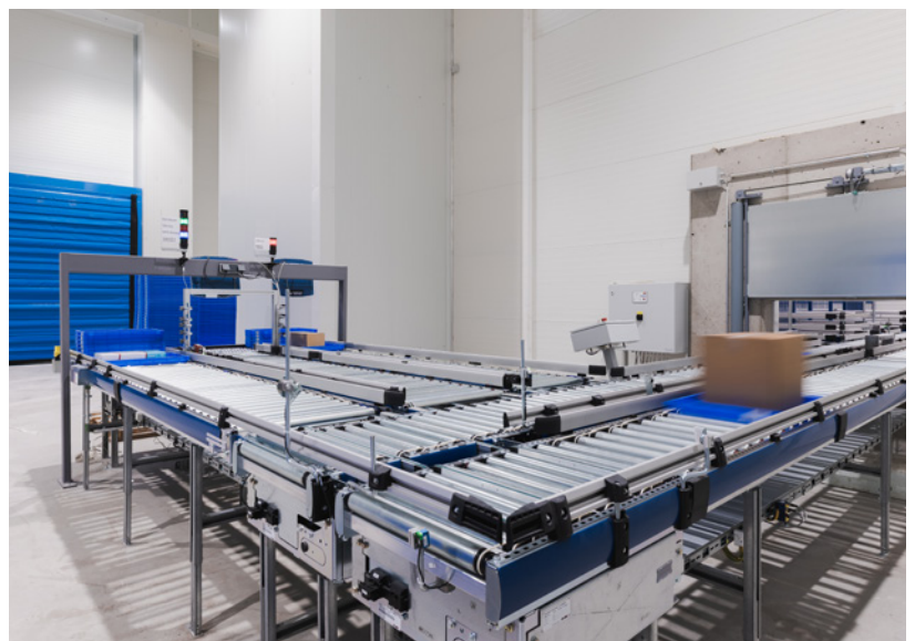
Order picking station in temperature-optimized work area