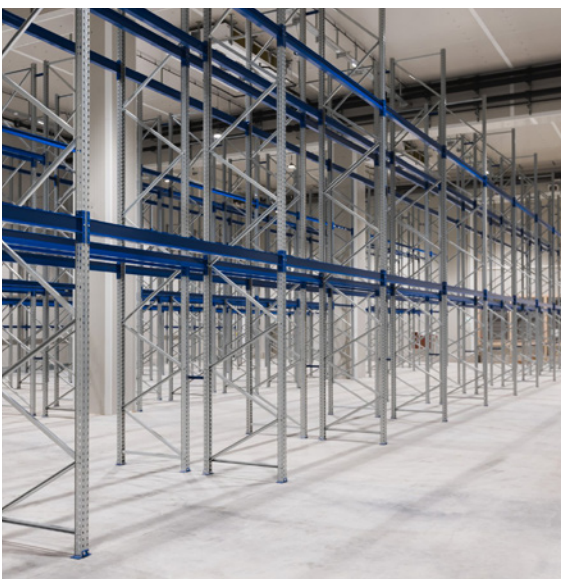
Storage locations in cold and dry areas