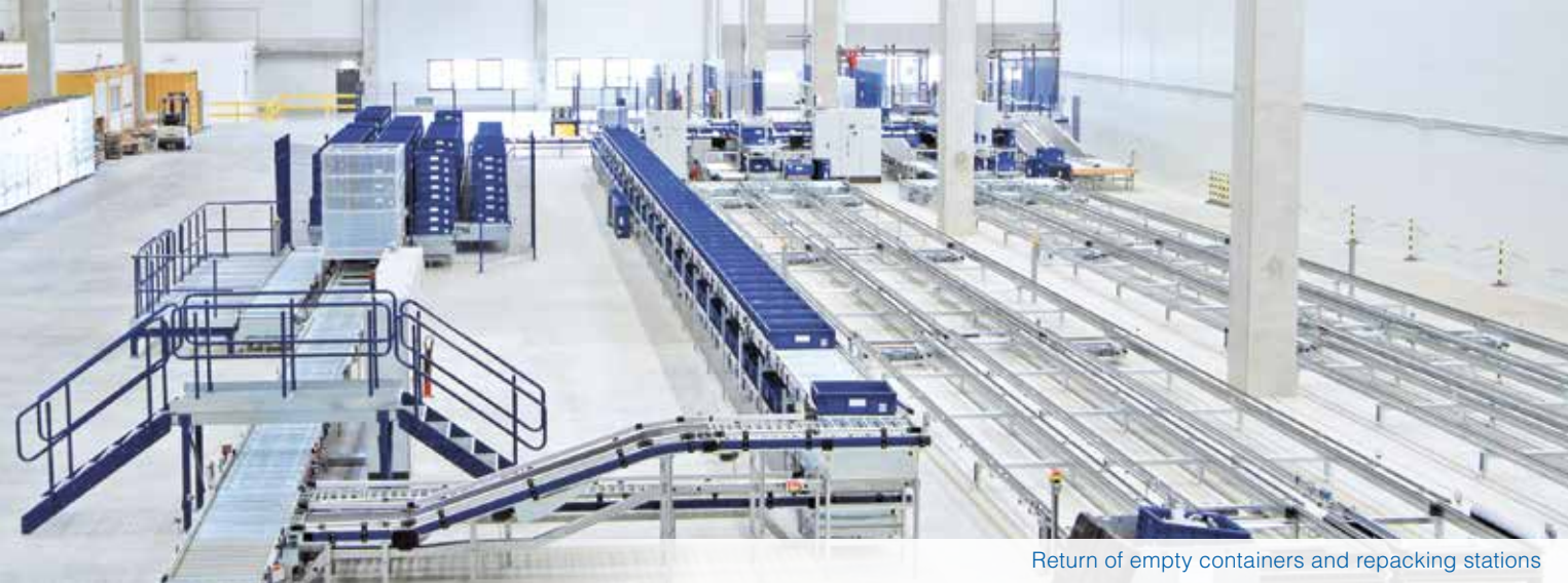
Return of empty containers and repacking stations